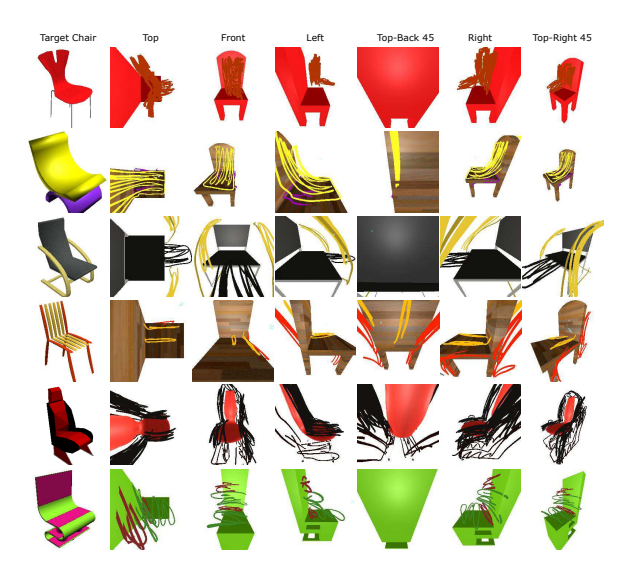
Figure 3: Examples of users that successfully triggered the system using a combination of sketches and model. The left column contains the target chairs, while the other columns contain a subset of the snapshots used by the system.