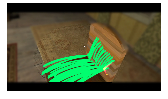
Figure 2: An example of a users sketch within the sketch interface.

the collection, commonly achieving the target model within a few iterations as shown in Fig. 3.